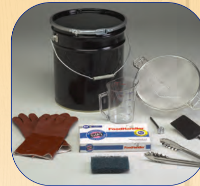
Ventless Fryer Accessory Kit