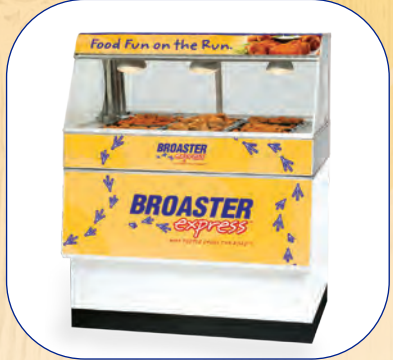
Floor Model Units