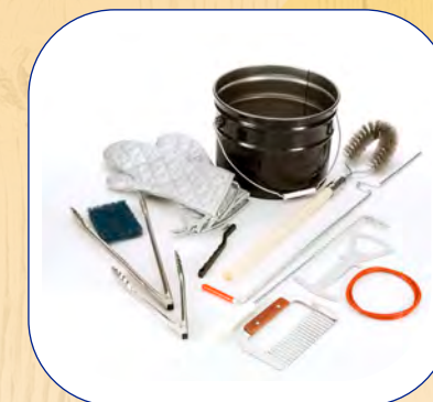
Pressure Fryer Accessory Kit